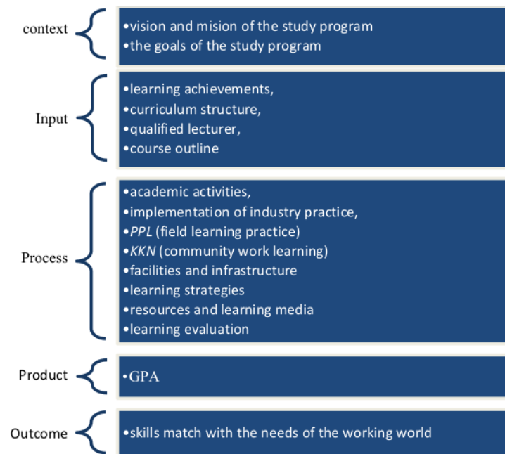
Figure 3. The Elements of CIPPO

In brief, there are five dimensions which are evaluated in the context of the process input, products, and outcome. The elements of each of the dimensions can be described in Figure 3.