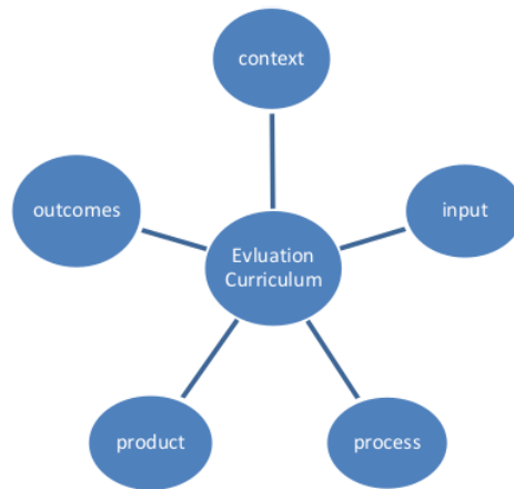
Figure 2. Five Evaluation Dimension CIPPO

CIPPO Model arranged with the aim to complete the basis of decision making in the evaluation of the program with oriented analysis on changes planned. The five dimensions can be drawn in Figure 2.